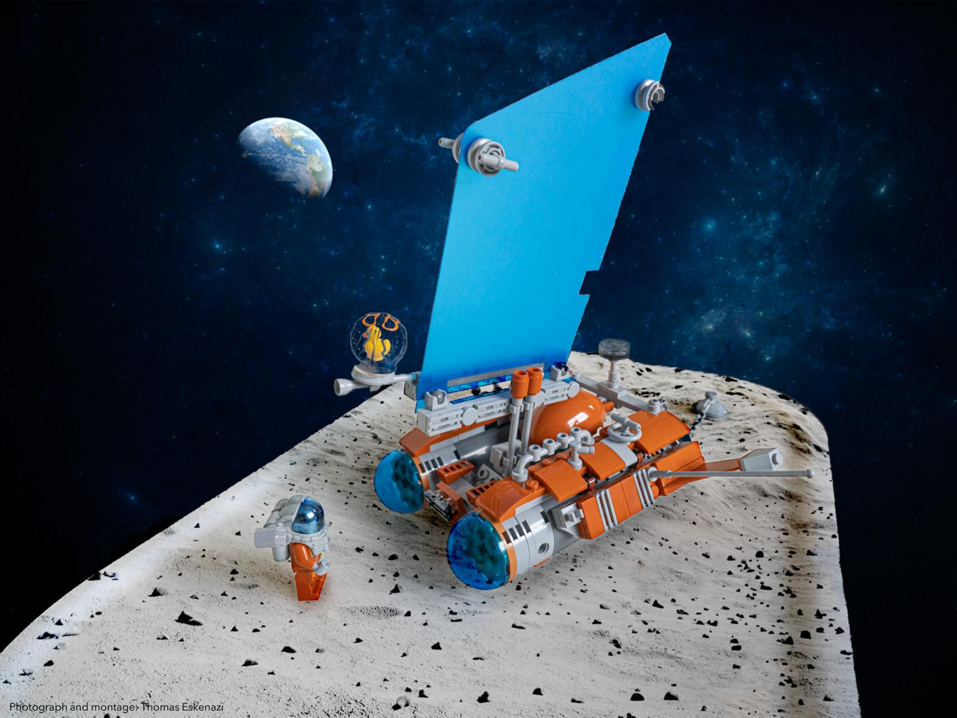
Photograph and montage: Thomas Eskenazi